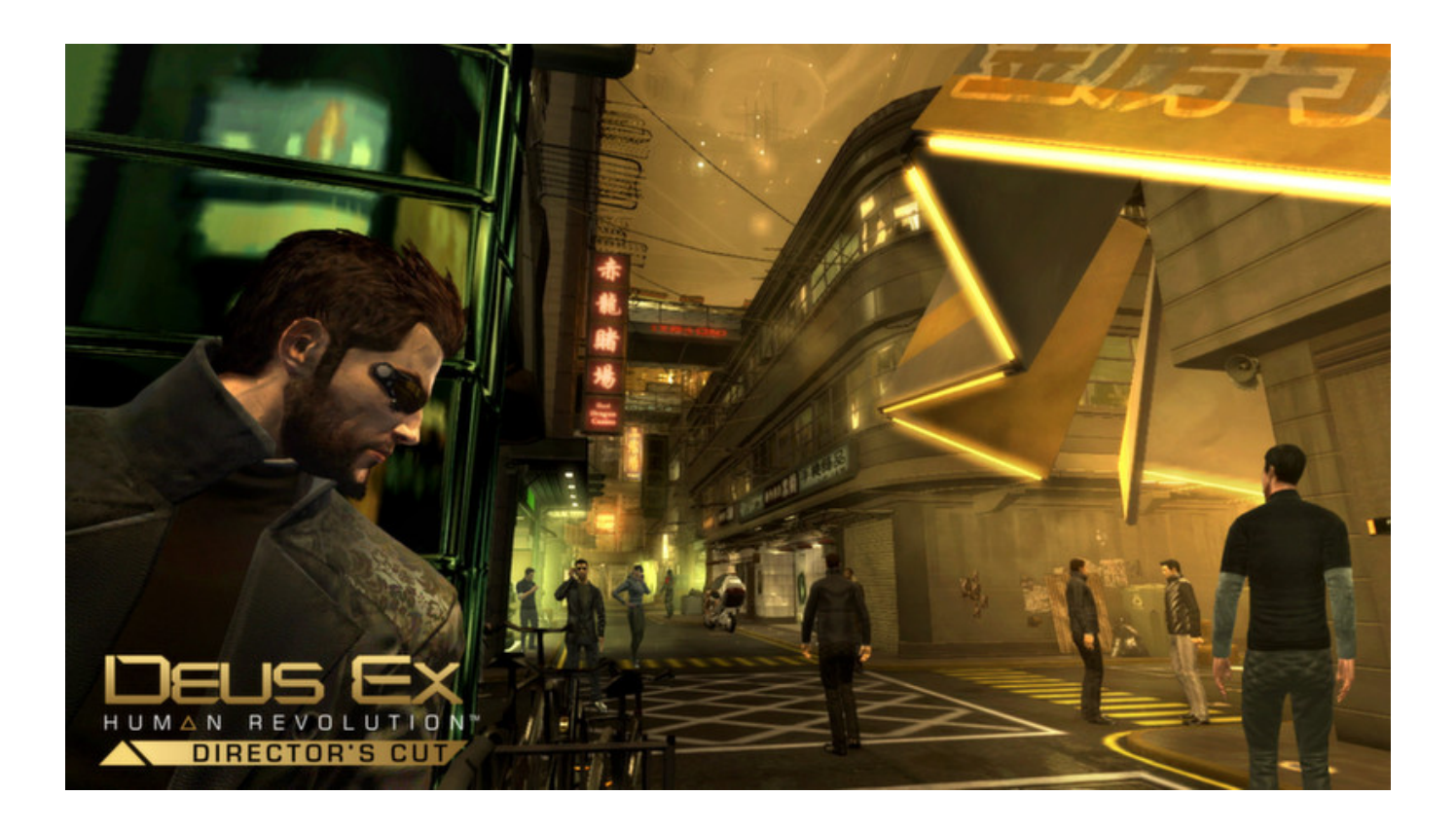
Deus Ex: Human Revolution - Director's Cut Crack Download For Windows 10

Download ->->-> <a href="http://bit.lv/2JpmM27">http://bit.lv/2JpmM27</a>